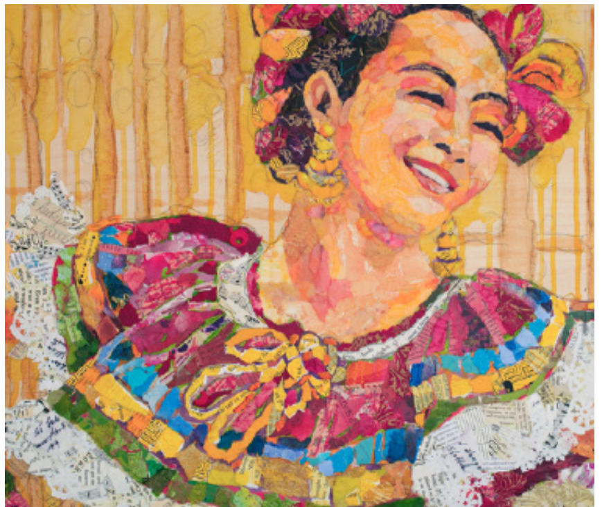
Andalusia / opposite color underpainting in the stripes of her dress

Beginner level painting is totally fine, it's the collage over the top that counts!